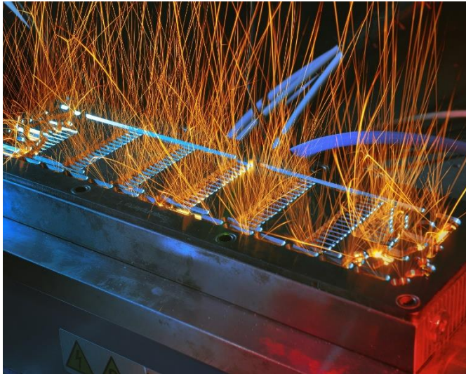
Figure 3: Double-beam welding of a bipolar plate: The innovative process enables faster and more efficient production of PEM fuel cells through the use of two simultaneous laser beams.