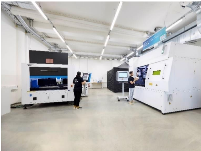
Figure 4: Fraunhofer ILT's Hydrogen Lab: a state-of-the-art research environment that covers the entire process chain of BPP production. Companies work here together with scientists on pioneering solutions – from the optimization of individual processes to the development of new technologies.